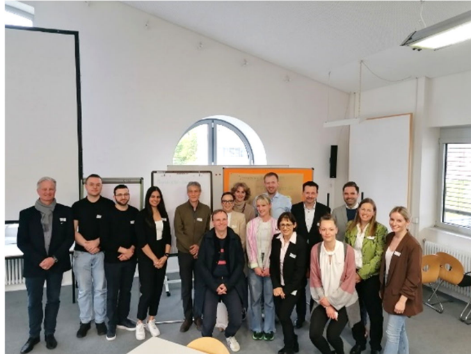
Training Managers and Lecturers Meeting 2024