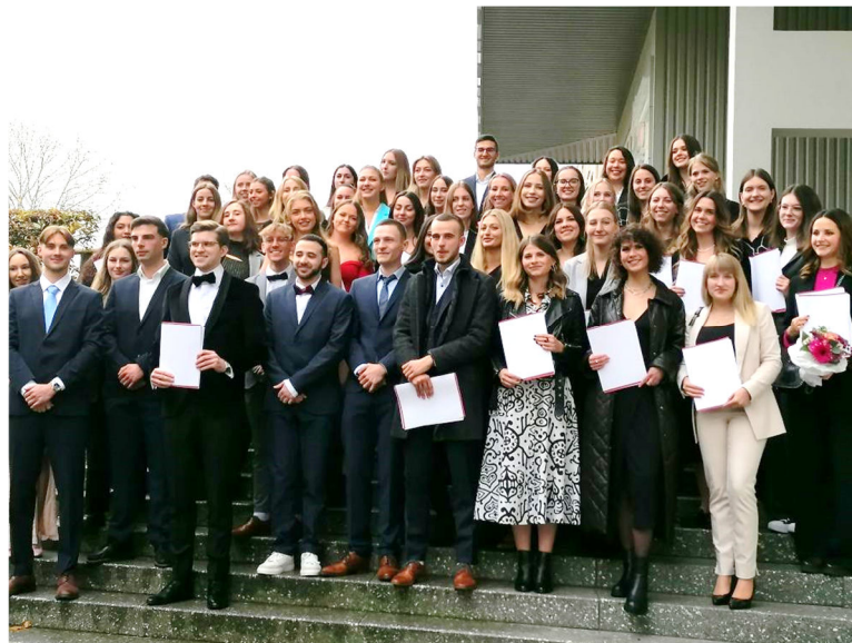
Graduation day of the WHC20 course