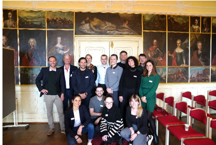
Alumni organisation team 2024/2025